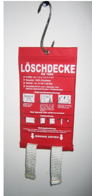
Pict. 6: Fire Blanket