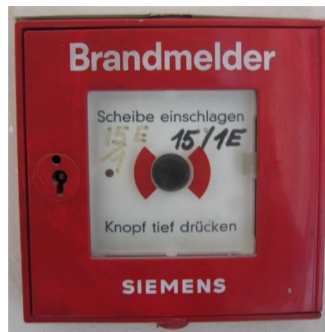
Pict. 1: Fire Alarm Button

In the entire building Fire Alarm Buttons are fixed close to the exit doors, the emergency exits and the access to the stairs (red boxes “Brandmelder” – see Pict.1). The black button is protected by a glass pane, which must be broken in case of fire. Pressing the button both releases the alarm of a siren in the building and sends a direct signal to the fire brigade at once. Every resident is obliged to remember the location of the nearest Fire Alarm Button and to activate it at once in the event of fire.