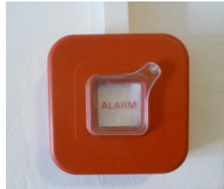
Pict. 1: fire alarm button

In the entire building fire alarm buttons are fixed close to the exit and the access to the stairs (red boxes – see Pict.1). The alarm-button is protected by a glass pane, which must be turned away in case of fire. Pressing the button both releases the alarm of a siren in the building and sends a direct signal to the fire brigade at once. Every resident is obliged to remember the location of the nearest Fire Alarm Button and to activate it at once in the event of fire.