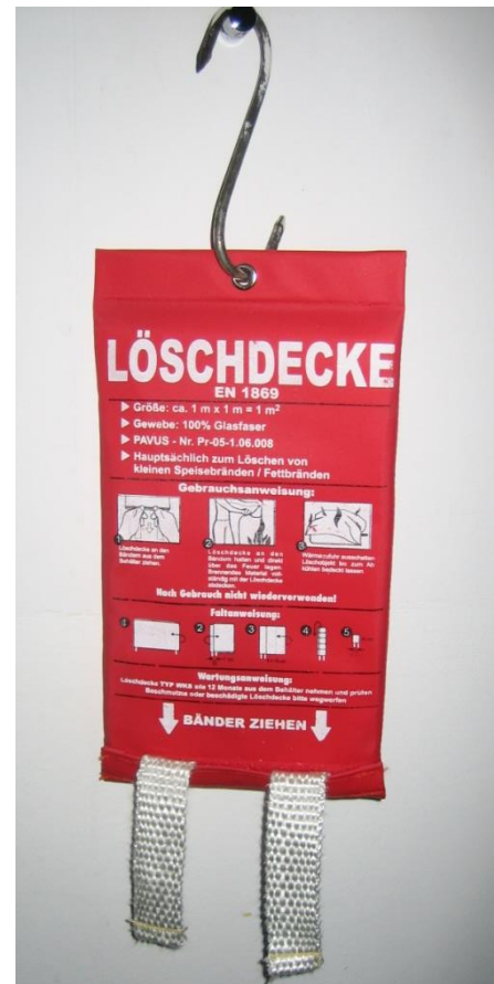
Pict. 4: fire blanket