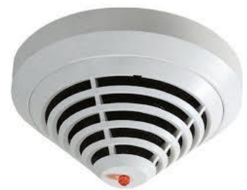
Pict. 2: Automatic Smoke Detector

The entire building, part of the building or fire compartment is fitted with Automatic Smoke Detectors on the ceilings (see Pict.2). These detectors trigger off an alarm if a certain concentration of smoke or vapour/steam or a certain temperature is exceeded. In order to avoid false alarms please observe the general measures to prevent fire. A radius of at least 50 centimetres must be kept free from objects around the detector at all times.