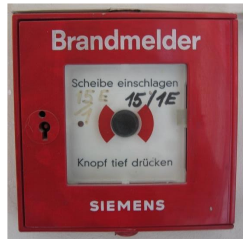
Pict. 1: Fire Alarm Button

In the entire building Fire Alarm Buttons are fixed close to the exit doors, the emergency exits and the access to the stairs (red boxes “Brandmelder” – see Pict.1). The black button is protected by a glass pane, which must be broken in case of fire. Pressing the button both releases the alarm of a siren in the building and sends a direct signal to the fire brigade at once. Every resident is obliged to remember the location of the nearest Fire Alarm Button and to activate it at once in the event of fire.