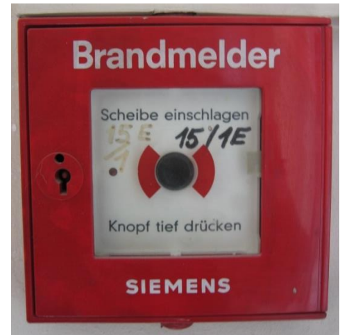
Pict. 1: Fire Alarm Button

In the entire building Fire Alarm Buttons are fixed close to the exit doors, the emergency exits and the access to the stairs (red boxes “Brandmelder” – see Pict.1). The black button is protected by a glass pane, which must be broken in case of fire. Pressing the button both releases the alarm of a siren in the building and sends a direct signal to the fire brigade at once. Every resident is obliged to remember the location of the nearest Fire Alarm Button and to activate it at once in the event of fire.