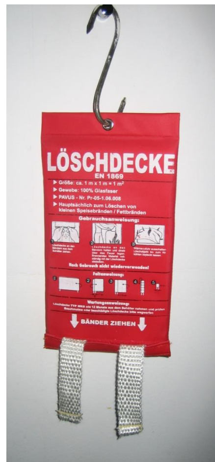
Pict. 5: Fire Blanket