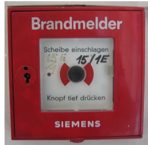
Pict. 1: Fire Alarm Button

In the entire building Fire Alarm Buttons are fixed close to the exit doors, the emergency exits and the access to the stairs (red boxes “Brandmelder” – see Pict.1). The black button is protected by a glass pane, which must be broken in case of fire. Pressing the button both releases the alarm of a siren in the building and sends a direct signal to the fire brigade at once. Every resident is obliged to remember the location of the nearest Fire Alarm Button and to activate it at once in the event of fire.