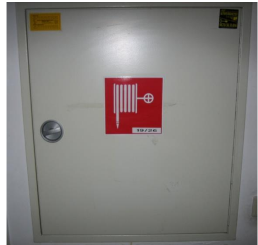
Pict. 4: Fire hose cabinet

Fire hose reels are mounted in wall-cabinets with a water tap (Pict.3); they are not meant for the fire brigade only but for everybody to use in the event of a fire – similar to a fire extinguisher. Please remember their location and how to operate them. Thus you can help to fight a fire when it breaks out.