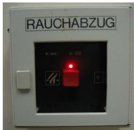
Pict. 6: Smoke Outlet Button

These push-buttons are located in the staircases (see Pict.5). Please remember their location and how to operate them. The push-buttons are protected by a glass pane. Breaking the glass and pushing the button activates the smoke outlets in the staircases.