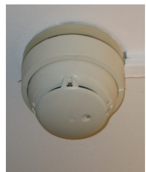
Pict. 2: Automatic Smoke Detector

The entire building, part of the building or fire compartment is fitted with Automatic Smoke Detectors on the ceilings (see Pict.2). These detectors trigger off an alarm if a certain concentration of smoke or vapour/steam or a certain temperature is exceeded. In order to avoid false alarms please observe the general measures to prevent fire. A radius of at least 50 centimetres must be kept free from objects around the detector at all times.