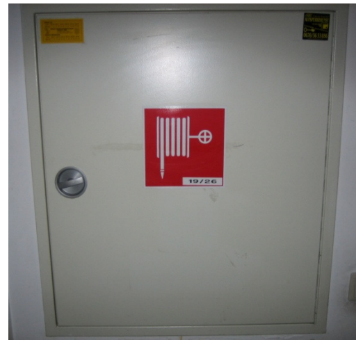
Pict. 4: Fire hose cabinet

Fire hose reels are mounted in wall-cabinets with a water tap (Pict.4); they are not meant for the fire brigade only but for everybody to use in the event of a fire – similar to a fire extinguisher. Please remember their location and how to operate them. Thus you can help to fight a fire when it breaks out.