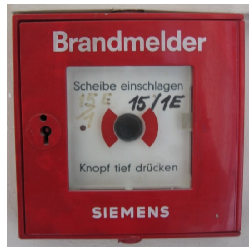
Pict. 1: Fire Alarm Button

In the entire building Fire Alarm Buttons are fixed close to the exit doors, the emergency exits and the access to the stairs (red boxes “Brandmelder” – see Pict.1). The black button is protected by a glass pane, which must be broken in case of fire. Pressing the button both releases the alarm of a siren in the building and sends a direct signal to the fire brigade at once. Every resident is obliged to remember the location of the nearest Fire Alarm Button and to activate it at once in the event of fire.