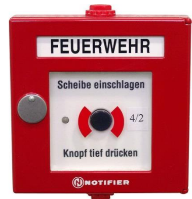
Pic. 4.1: fire alarm button

These buttons trigger the fire alarm. Pushing the button not only raises an alarm (siren) in the house, but also alerts the fire brigade directly and immediately. Every resident is required to memorize the location of the nearest fire alarm button and to activate it when a fire is detected.