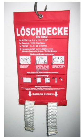
pic. 4.6: fire blanket