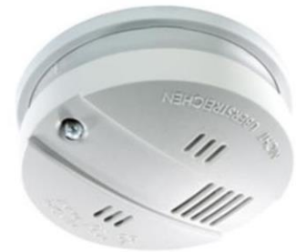
pic. 4.4: Domestic smoke alarm

The domestic smoke alarms are battery-operated and fitted with a blinking light. If the battery runs low the device will give off a signal. In that case please inform the residence manager to replace the battery.