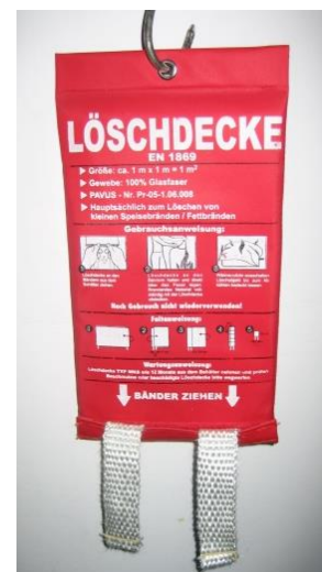
pic. 4.3: fire blanket