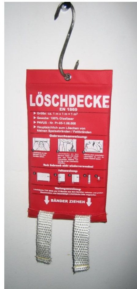
Pict. 2: Fire Blanket