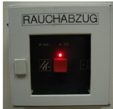
Pict. 6: Smoke Outlet Button

These push-buttons are located in the staircases (see Pict.6). Please remember their location and how to operate them. The push-buttons are protected by a glass pane. Breaking the glass and pushing the button activates the smoke outlets in the staircases.